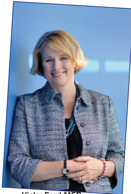
Vicky Ford MEP East of England

I hope this factsheet helps ensure your holiday is memorable for all the right reasons.